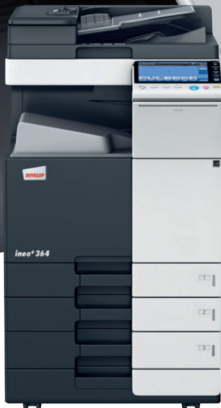
ineo+ 364 with paper feeder (PC-110) and dual scan document feeder (DF-701)