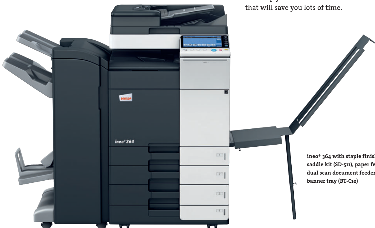
ineo+ 364 with staple finisher (FS-534), saddle kit (SD-511), paper feeder (PC-210), dual scan document feeder (DF-701), banner tray (BT-C1e)

Many multifunctional office systems are anything but user-friendly. The ineo+ 364, in contrast, is simplicity itself. An intuitive, easily understandable operating concept ensures that it is as easy to use as your smartphone or tablet. The 9-inch capacitive touchscreen comes with well-known functions such as flick&drag, and thanks to a new menu navigation structure you can see all functions in one go and select the settings you want with just a few clicks. Frequently used functions can be left on the start screen and ones you don't use simply removed. This is the kind of customisation that will save you lots of time.